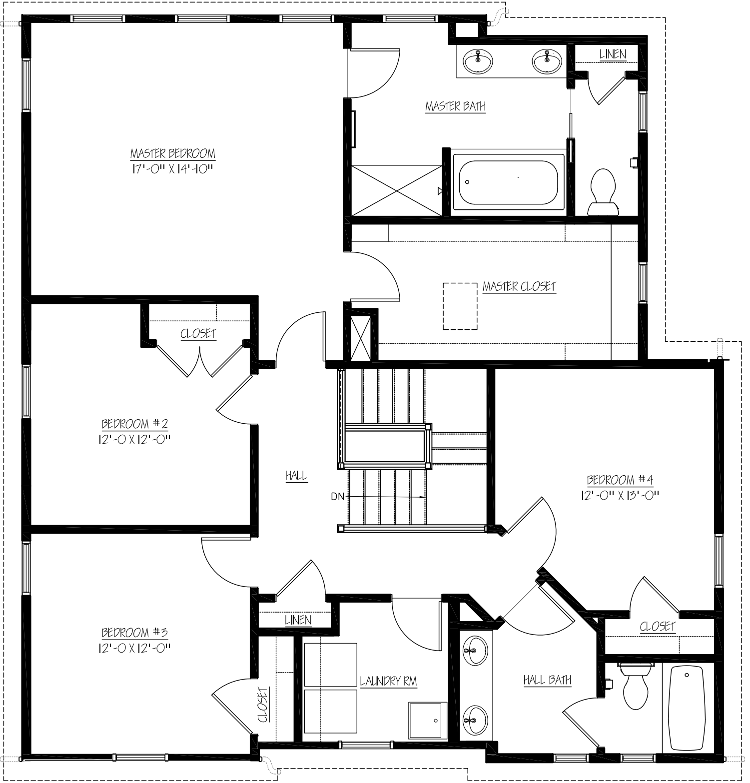
MANOR HOMES AT WESTFIELD MODEL 803- SECOND FLOOR PLAN